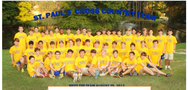
Largest Cross Country team ever!