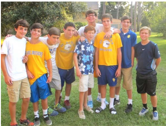
8 th graders tail gate before game.

Parent Mini Schedule: On Mon, Sep 9, beginning at 6:30 PM, we will hold our annual Parent Mini Schedule Night. Parents will follow their son's academic schedule, with each period lasting 10 minutes. Teachers will give a brief overview of the class. We get positive reviews on this night, so we encourage parents to attend and meet the teachers personally. This is NOT a night for extended parent-teacher discussions so please do not come expecting that. Individual conferences/contact can be set up for later dates. Hope you can make this informative evening. Parents should be in their son's A Period classroom by 6:30.