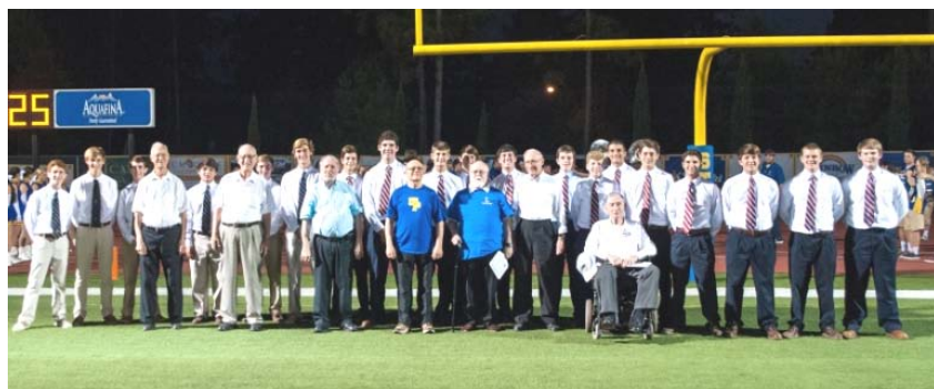
Retired Brothers presented by SPS & AR student councils.