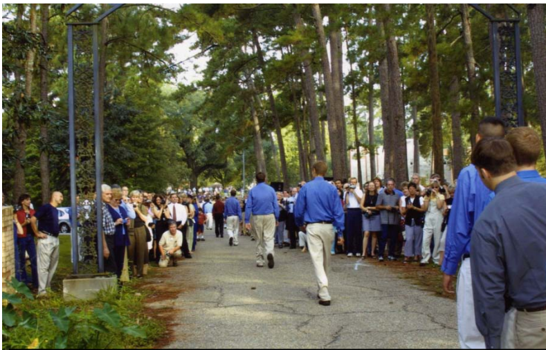
As we remembered Katrina last week, here's a photo of a pre-Katrina March through the Arch. How the landscape has changed!