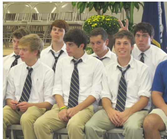
Seniors clowned during ring ceremony practice but performed extraordinarily well at the event itself.

Attendance: Please comply with our attendance regulations as printed in the handbook which is posted on Edline. This is especially true when a student is absent or needs to check out during the day.