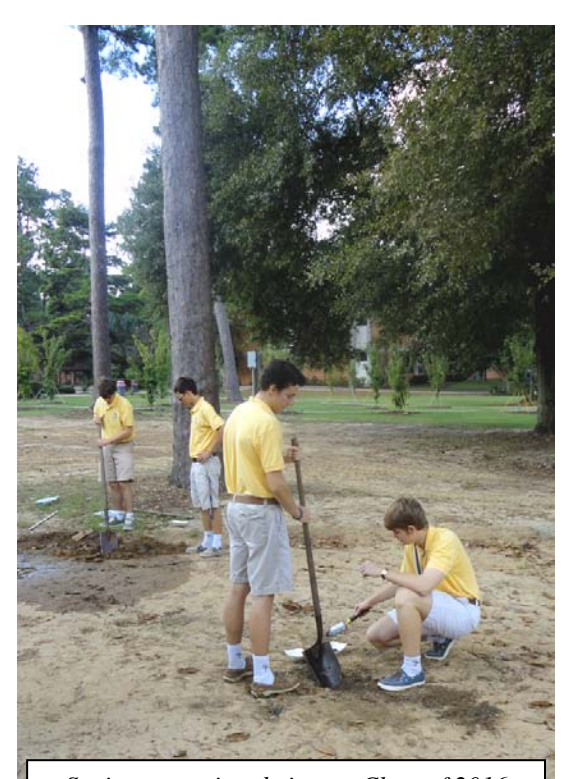
Seniors, sporting their new Class of 2016 gold uniform shirts, help prepare the new wetlands area in back of the new gym which will be used for teaching purposes.

Student Football Game Conduct: Allow me to review the rules: