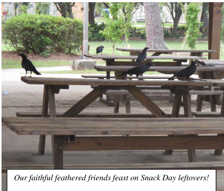
Our faithful feathered friends feast on Snack Day leftovers!

Drug Testing: We have begun drug testing, choosing students both randomly and “for cause.” As we continue our healthy choices war, I remain convinced that testing is the best deterrent. Know our policy by reviewing the handbook. Reinforce with your sons. A second positive result jeopardizes a student's place at SPS. Pray that students resist the allure of temporary