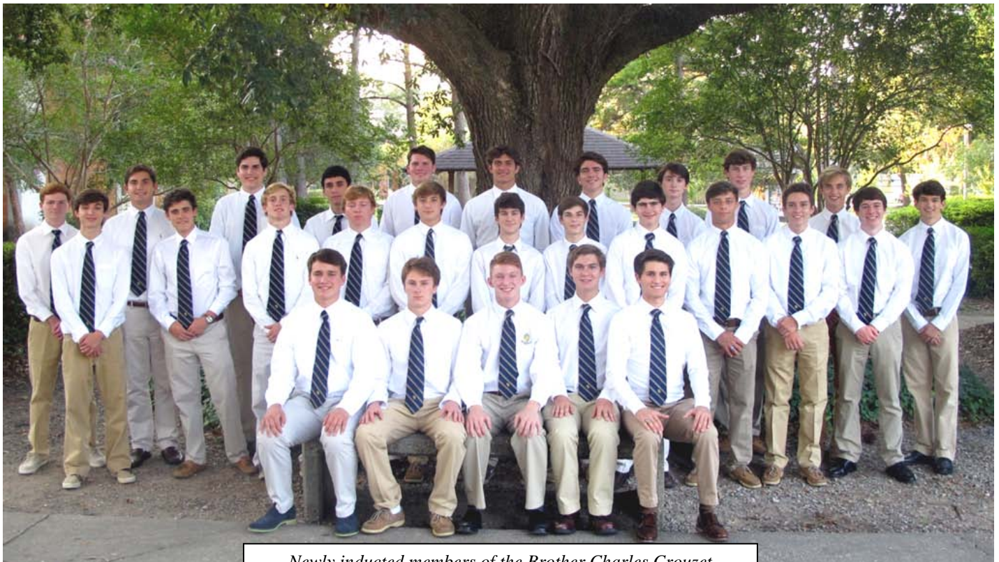
Newly inducted members of the Brother Charles Crouzet Chapter of The National Honor Society!

...and doing ordinary things extraordinarily well by making courageous choices each and every day and doing God's will.