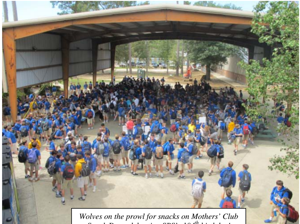
Wolves on the prowl for snacks on Mothers' Club Snack Day celebrating SPS's 104 th birthday!