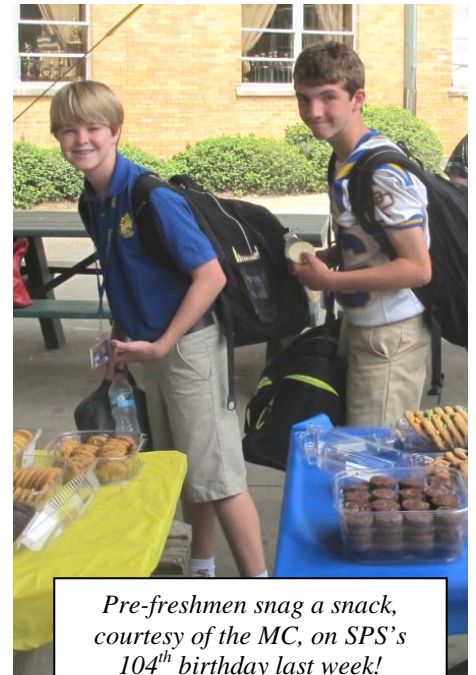
Pre-freshmen snag a snack, courtesy of the MC, on SPS's 104 th birthday last week!