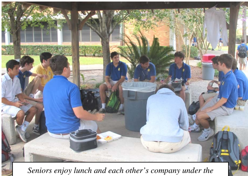
Seniors enjoy lunch and each other's company under the Matthew Booth Memorial Pavilion.

A Lesson in Irony: Irony is defined as an outcome of events contrary to what was, or might have been, expected. For example, on a "late start" morning, one might reasonably expect that the number of tardy students would be fewer than on a regular start date. Wrong! In actuality, the number of students tardy last Monday was the HIGHEST since the beginning school! Amazing!