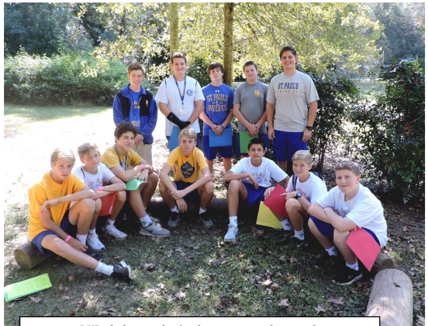
LYLs help run the freshman retreat last week.