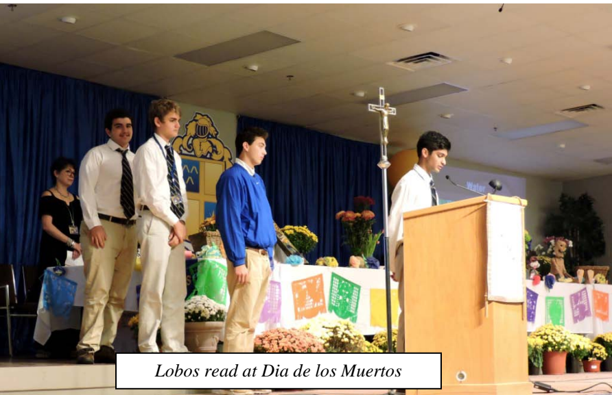
Lobos read at Dia de los Muertos

handbook – which you pledged to uphold at the beginning of the year when you signed. And we just can’t stop everything to deliver an assignment, a lunch, a message – we just don’t have the personnel. Thanks for understanding.