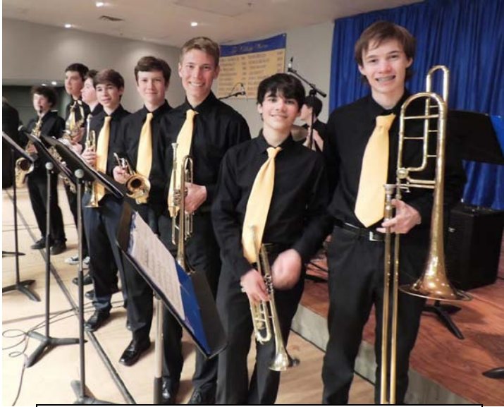
SPS Jazz Band members wow the crowd at Celebrity Waiters Dinner on Thursday night!

Scripture tells us that God's ways are not our ways. Could there be a more relevant example of how God brings good out of evil, strength out of weakness, salvation out of despair? Could the Hand of God be any more obvious in our school's existence? Could we have any doubt that our work today is God's work -- a continuation of that miraculous journey to Covington, those incredible stories of heroic men giving their lives for the sake of Lasallian Mission?