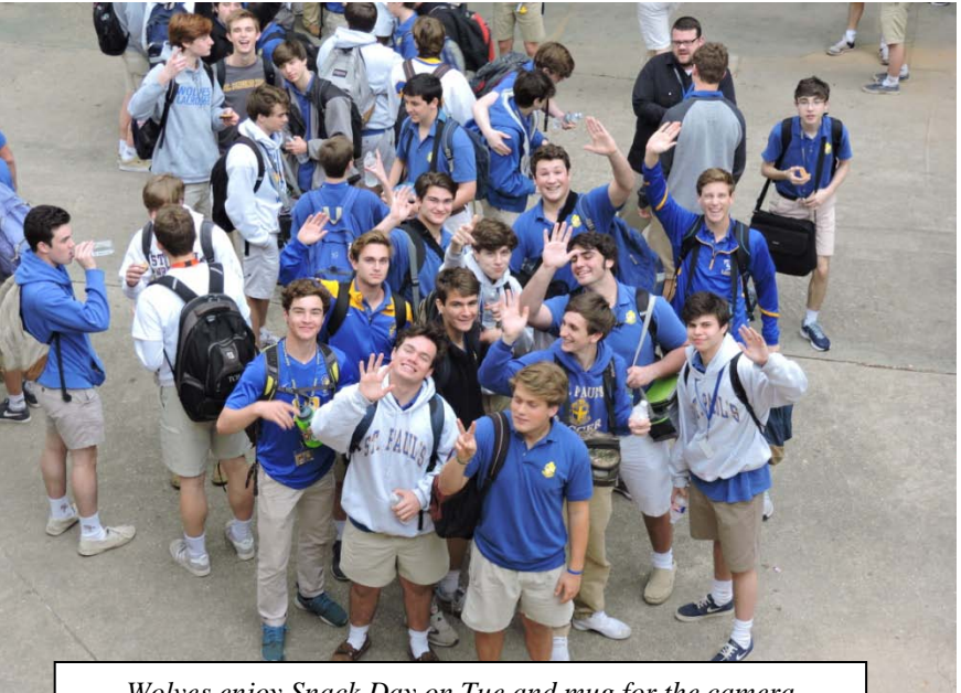
Wolves enjoy Snack Day on Tue and mug for the camera

End of Third Quarter: We do not give exams at the end of the first and third quarters. Report cards will be prepared based upon your son's grades as of this Friday. Please make sure he is up to date in all of his classes. Report cards will be emailed mid-week next week.