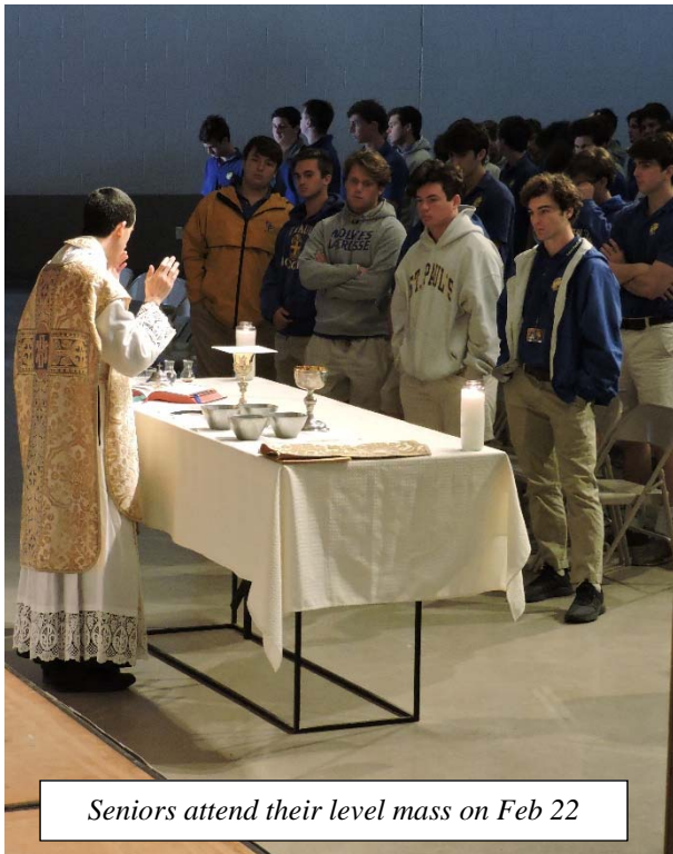
Seniors attend their level mass on Feb 22