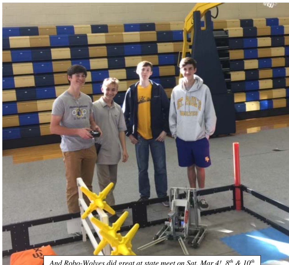
And Robo-Wolves did great at state meet on Sat, Mar 4! 8 th & 10 th grade made it to semi-finals and 9 th grade team won FIRST PLACE in State! On to World Competition!