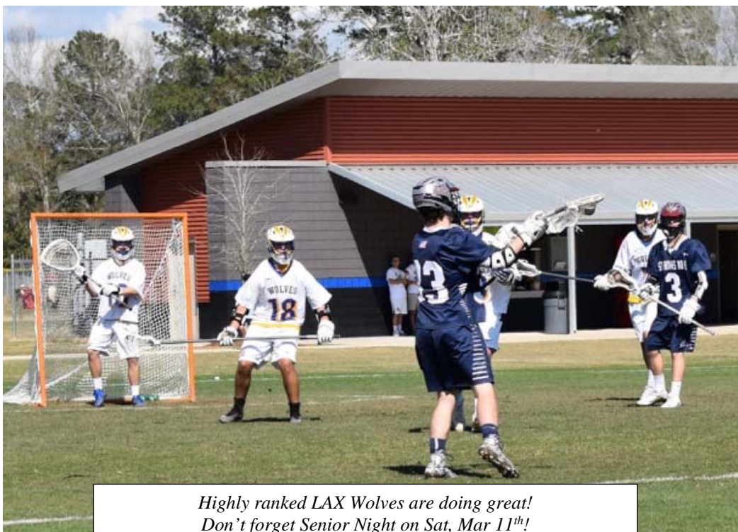
Highly ranked LAX Wolves are doing great! Don't forget Senior Night on Sat, Mar 11 th !