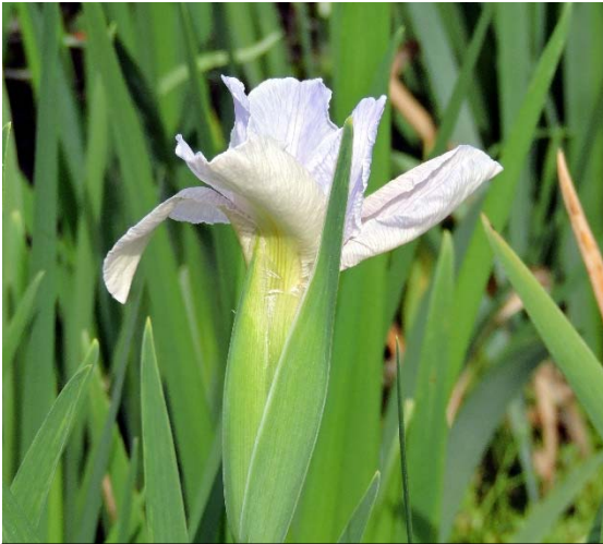
Iris blooms are appearing on campus – indicating springtime, the etymology of Lent.

Remember that we are dust and to dust we shall return!