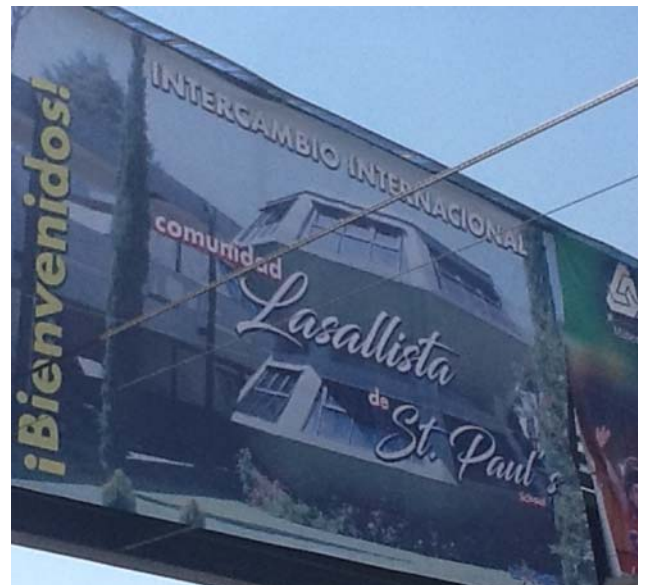
A billboard in Mexico City greeted SPS students on the two-week exchange program – and reinforced the international character of Lasallian education.

Today, we are the ones entrusted with that Mission. Today, we must be faithful. Today, we are the cooperators with God in His plan of salvation. Today, we must honor our ancestors and, yes, thank Pancho Villa for granting the Brothers a release from prison and a safe journey from Mexico. Who knows what good will come from our work today -- even when times are tough and the future blurry? May our Lenten journey give us eyes of faith and merciful hearts!