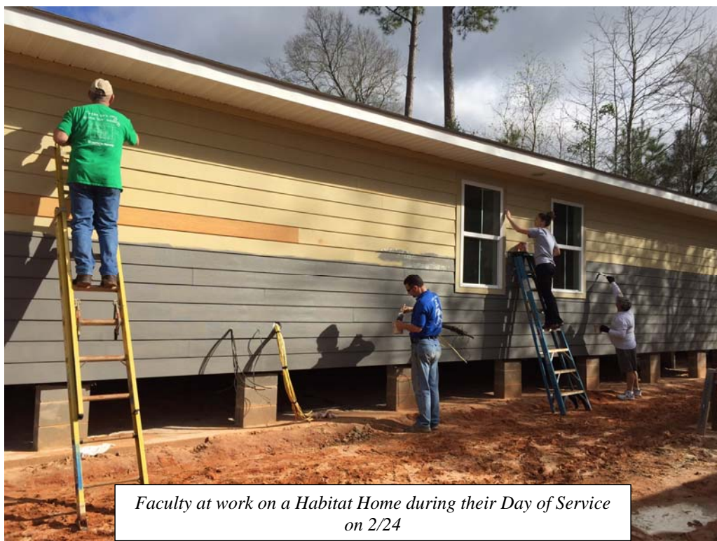
Faculty at work on a Habitat Home during their Day of Service on 2/24