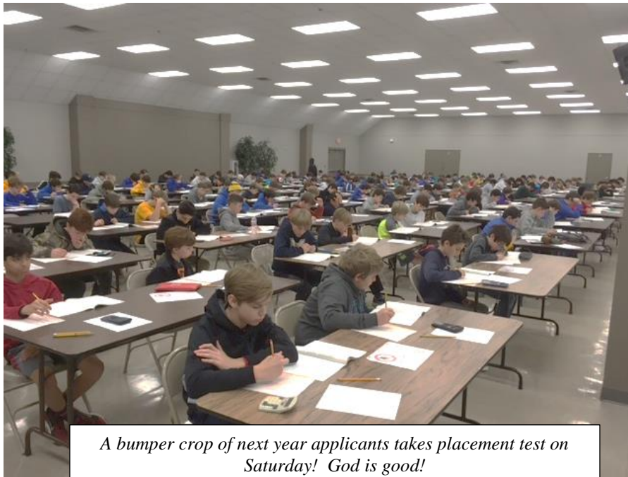
A bumper crop of next year applicants takes placement test on Saturday! God is good!

Sun, Jan 15 -- I encourage Catholic families to attend Mass and non-Catholic ones to worship at church of choice.