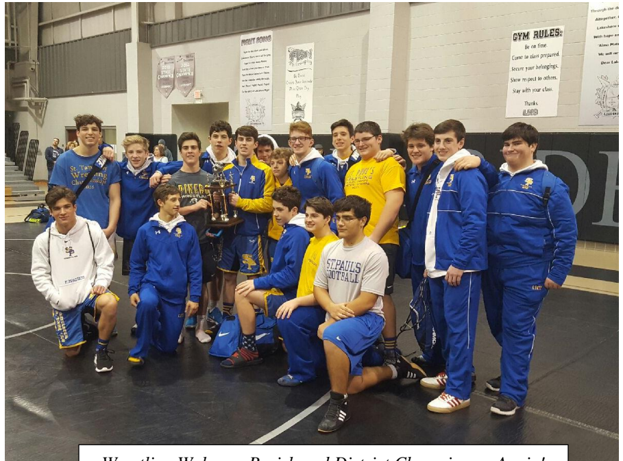
Wrestling Wolves – Parish and District Champions – Again!