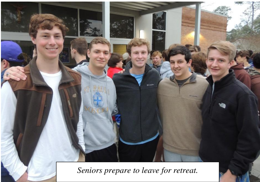
Seniors prepare to leave for retreat.