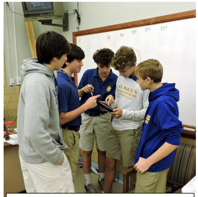
Sophomores review for their exam before holidays begin.

Building Upgrades: Over the holidays, five more main school building classrooms had flooring improvements. The failing tiles were removed, the exposed concrete was grinded and then polished. The floors look very nice. This completes the bottom floor of that building. Thanks to the physical plant crew, who had to empty all of the rooms on Friday afternoon and then had to clean! Also, thanks to the kindness of Mr. Randy Rush, we have begun replacing broken masonry tiles (both inside and outside) in that 1949-