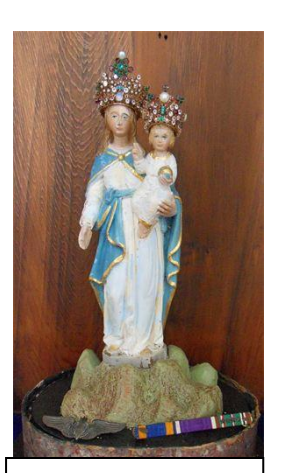
Original OLPS brought from France in 1727 by Ursuline nuns.