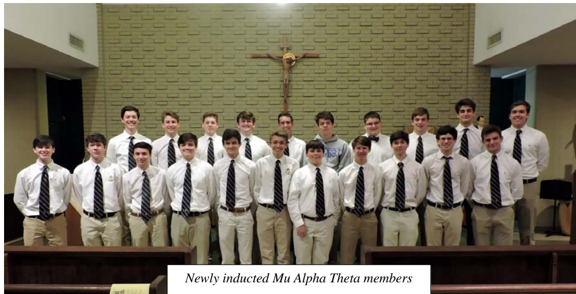
Newly inducted Mu Alpha Theta members