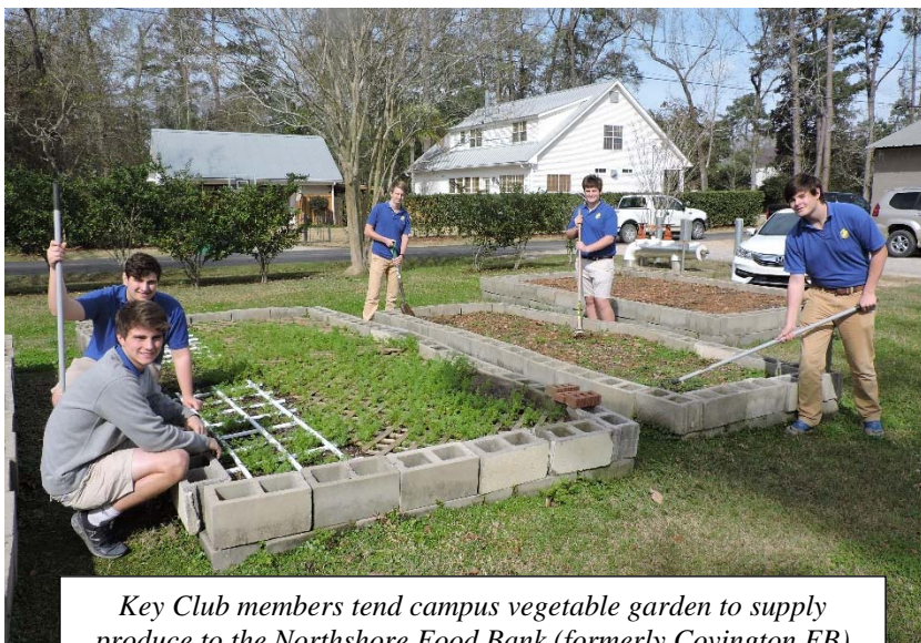
Key Club members tend campus vegetable garden to supply produce to the Northshore Food Bank (formerly Covington FB)

Archdiocese of New Orleans Family Life Apostolate’s FATHER-SON HUMAN SEXUALITY PROGRAM Archdiocese of New Orleans Family Life Apostolate presents a FATHER-SON HUMAN SEXUALITY PROGRAM for fathers and their 12-14-year-old sons on Sunday, March 19, 2017 from 5-8 PM in St. Mary’s Hall at St. Peter Catholic Church, Covington. Fathers and sons are invited to grow together in God’s gift of human fertility and the wonder of growing up and becoming a man. The program is based on the teachings of Pope Saint John Paul II’s “Theology of the Body”. Presenters include peers, health care professionals and fathers. Cost is $25. For more information, please contact St. Peter Office of Religious Education, 985.893.2446 or email ore@stpeterparish.com .