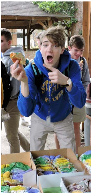
Beau expresses delight at last week's king cake treat courtesy of Mothers' Club

Life and Dignity of the Human Person: As we approach anniversary of the Roe v. Wade decision, it's most appropriate to remember the Church social teaching on the Life and Dignity of the Human Person. From the US Catholic Bishops Web Site: In a world warped by materialism and declining respect for human life, the Catholic Church proclaims that human life is sacred and that the dignity of the human person is the foundation of a moral vision for society. Our belief in the sanctity of human life and the inherent dignity of the human person is the foundation of all the principles of our social teaching. In our society, human life is under direct attack from abortion and assisted suicide. The value of human life is being threatened by increasing use of the death penalty. The dignity of life is undermined when the creation of human life is reduced to the manufacture of a product, as in human cloning or proposals for genetic engineering to create "perfect" human beings. We believe that every person is precious, that people are more important than things, and that the measure of every institution is whether it threatens or enhances the life and dignity of the human person.