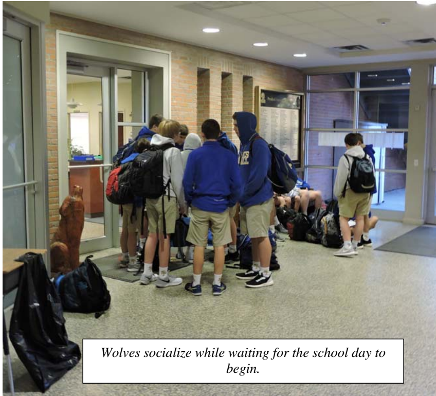
Wolves socialize while waiting for the school day to begin.