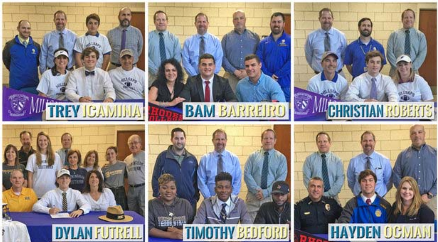
Six Wolves signed college athletic scholarships last week