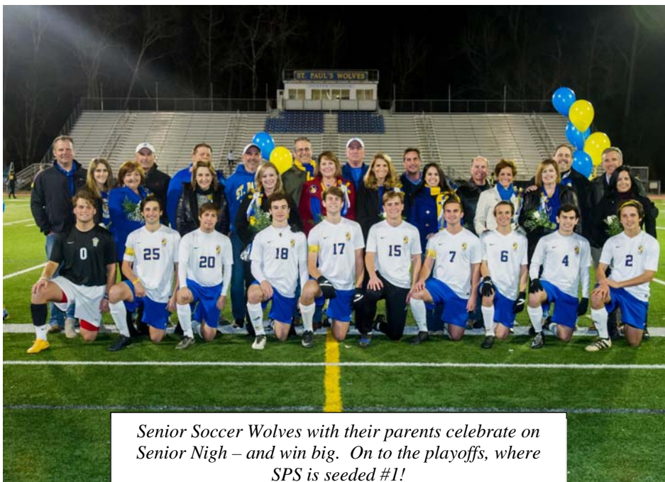
Senior Soccer Wolves with their parents celebrate on Senior Nigh – and win big. On to the playoffs, where SPS is seeded #1!

Annual Fund: Many thanks to those who have responded to my request. For clarity, I offer the following: