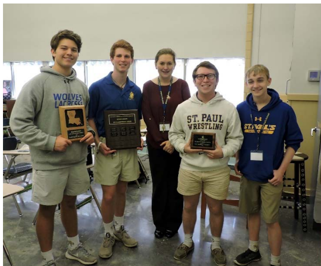
Student Council show off some of their awards from the state convention in January.