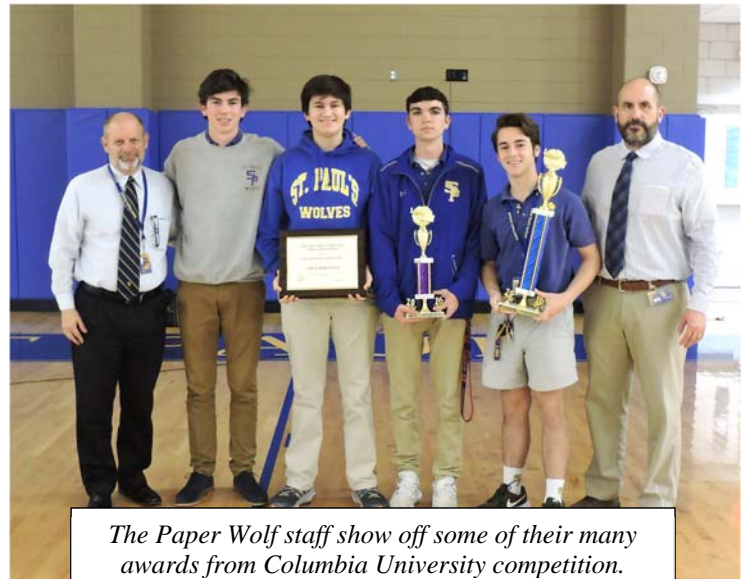
The Paper Wolf staff show off some of their many awards from Columbia University competition.