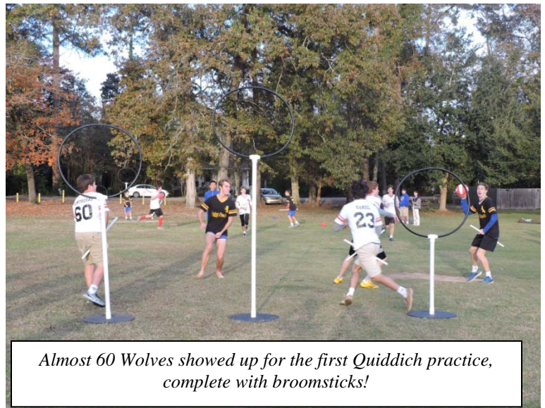
Almost 60 Wolves showed up for the first Quiddich practice, complete with broomsticks!