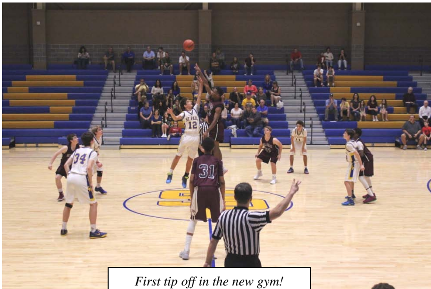
First tip off in the new gym!

7:40 Chimes 7:45 – 9:20 Period E 9:27 – 11:02 Period F/SSR 11:02 – 11:42 Lunch 11:47 – 1:12 Period G 1:19– 2:04 Period A Exam Review 2:10 Dismissal