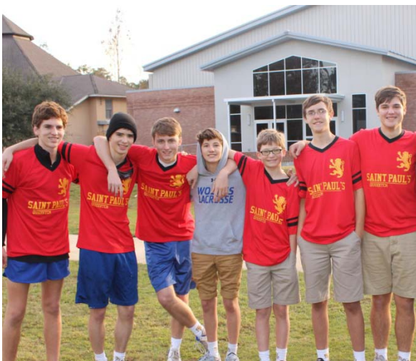
Quiddich Wolves from the House of Gryffindor enjoy first practice in their House shirts!

• At this point I was WAY overtime, so we sang the fight song. I then encouraged the students to make the most of Advent and to join us in the chapel at 7 am on Wednesday mornings for mass. I told the students about Maranatha – the one word prayer which means “Come, Lord” and encouraged them to say it frequently during Advent.