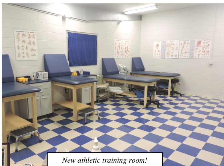
New athletic training room!

Important Driver's License Requirement: A new requirement was added to the driver's license issuance process for all minor applicants. All minor applicants must produce proof the applicant has either received a diploma or is currently enrolled in a high school program. This is done through a school attendance form from his or her high school prior to applying for a driver's license.