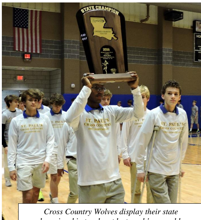
Cross Country Wolves display their state championship trophy at last week's assembly.

Let's face it – tuition does NOT cover the cost of running Saint Paul's. Hence, we have fundraisers. As stated above, I've launched our Annual Fund Drive, and if you can give, that's great. If not, I understand but ask that you pray for Saint Paul's. In turn, we pray for financial health for all.