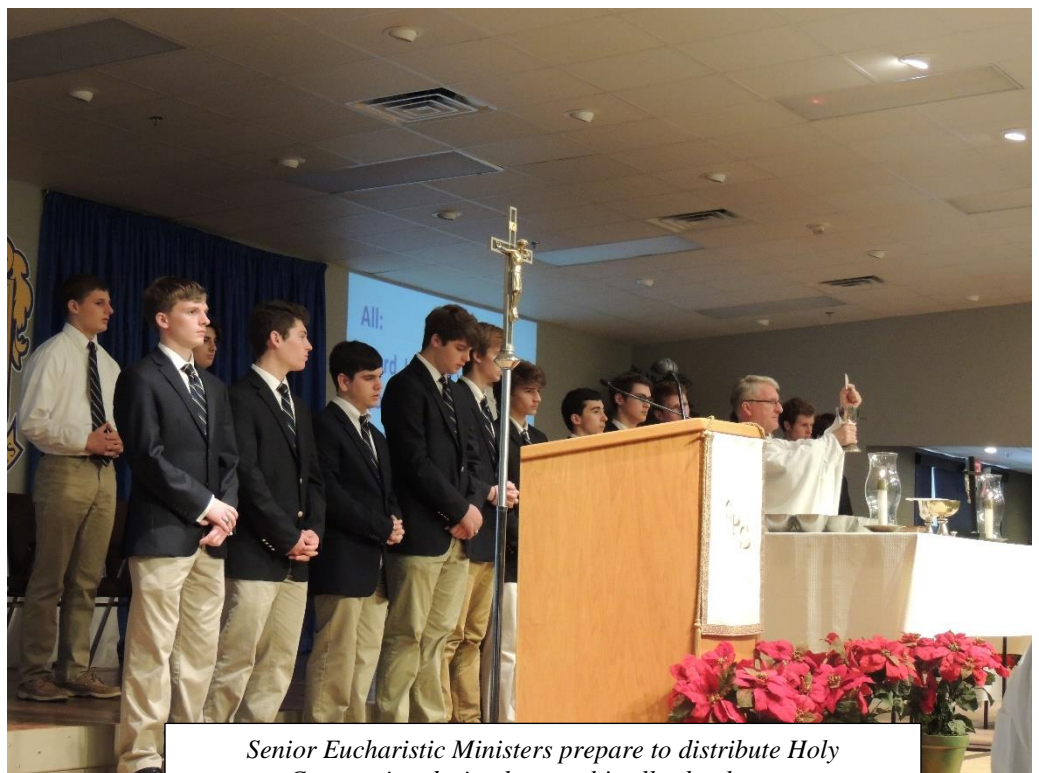
Senior Eucharistic Ministers prepare to distribute Holy Communion during last week's all school mass.