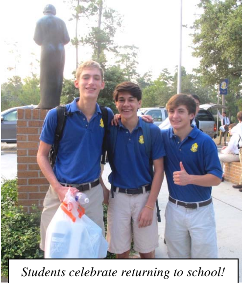
Students celebrate returning to school!

Cell Phone Policy: We instituted a new policy last year and it worked fine so we are continuing it: students may use their phones during lunch but only outside. We were losing this battle so we made this concession – but we will be relentless in enforcing the no cell phone ban during class time and inside buildings. So if you need to call or text your son, do so during the lunch hour. With our new campus wide wi-fi, he can now use his phone to surf the internet if needed. And, yes, our security firewalls are in effect. And as mentioned above, we are now a No Yik Yak Zone.