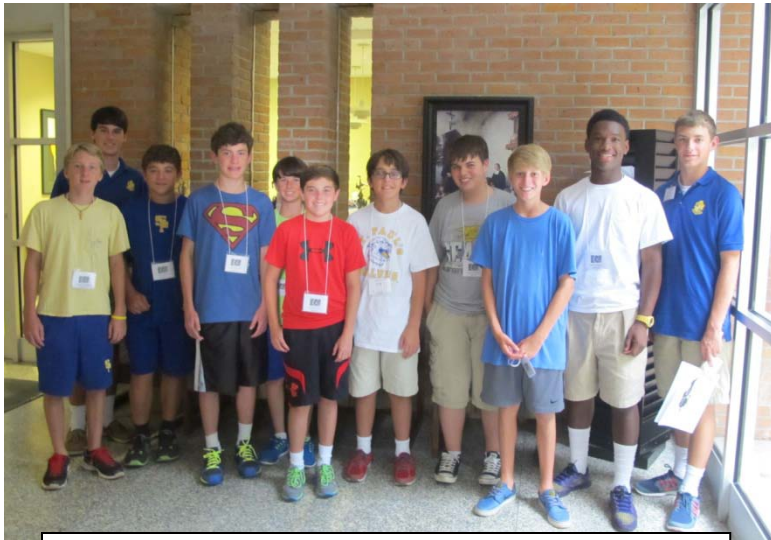
Another group of pre-freshman at orientation

New LA Laws: In case you weren't aware, the following legislative acts became law on Aug 1: