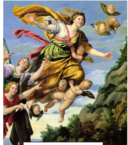
Assumption of the Virgin Francesco Botticini 1446-1497