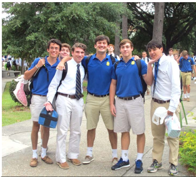
Students show their joy at being back at school!

Helping Saint Paul's: Don't forget – If you shop at Office Depot, please give the SPS school code (70041640) and SPS receives 5% of your purchase!