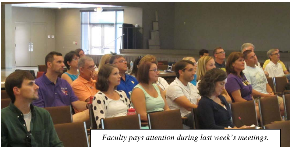
Faculty pays attention during last week's meetings.

LA Tax Info: The LA Department of Revenue reminds parents that back-to-school shopping can qualify for a $5,000 per-dependent tax deduction on their state tax returns next year by saving receipts. Items such as uniforms, supplies and TUITION are eligible for tax breaks on the income tax forms