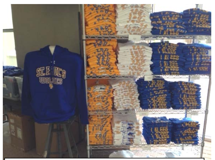
Mothers Club Bookstore shelves are well-stocked and ready for sale this week. Thanks, MC!

• Purchasing school pictures is optional. Pricing and order form is posted on our web site (<u>www.stpauls.com</u>) AND ALSO AVAILABLE IN THE BOOKSTORE.