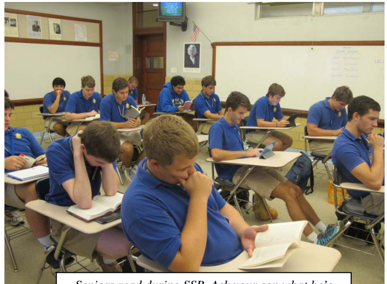
Seniors read during SSR. Ask your son what he's reading. Consider a family SSR time!