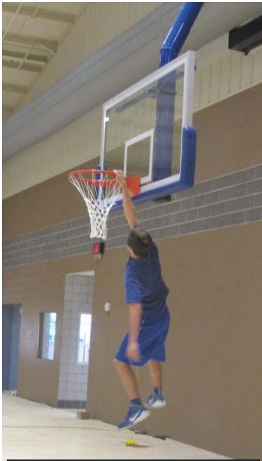
A basketball wolf tests the new goals in the new gym.

Driver's License Proof of Attendance: Don't forget: you son will need proof of attendance in order to get a learner's permit. The forms are in the counseling department or the administration building. I feel terrible when a parent waits two hours at the DMV only to be turned away b/c the son doesn't have his proof of attendance. This is a legislative act, so don't blame me!