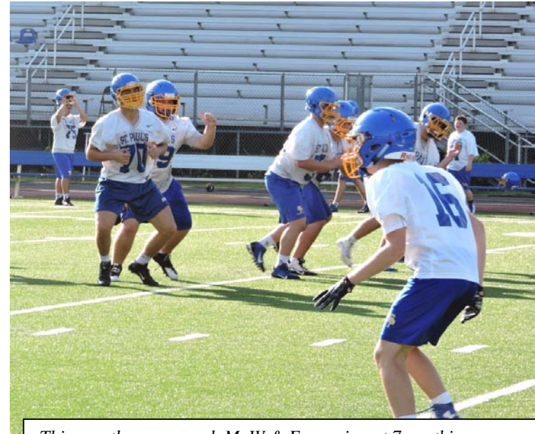
This was the scene each M, W & F morning at 7 am this summer as the Gridiron Wolves anticipate the 2016 season!