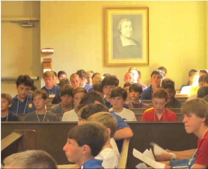
St. La Salle gazes over his newest crop of “sons” at pre-freshman orientation.

Helping Saint Paul’s: Don’t forget – If you shop at Office Depot, please give the SPS school code (70041640) and SPS receives 5% of your purchase!