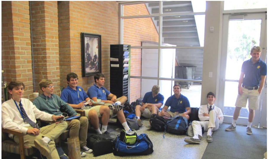
Seniors "chillaxin" in the lobby during lunch

www.revenue.louisiana.gov/schooldeduction .