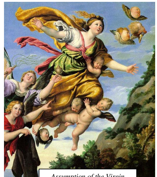
Assumption of the Virgin Francesco Botticini 1446-1497