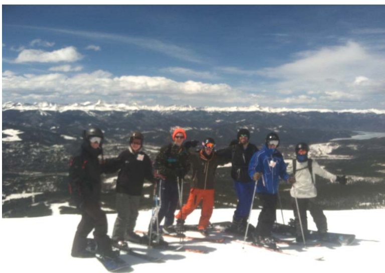
Mile High Mission Trip Wolves ski in Breckenridge on last day of their trip. They deserve the break after the hard work they did all week on behalf of Denver's homeless!