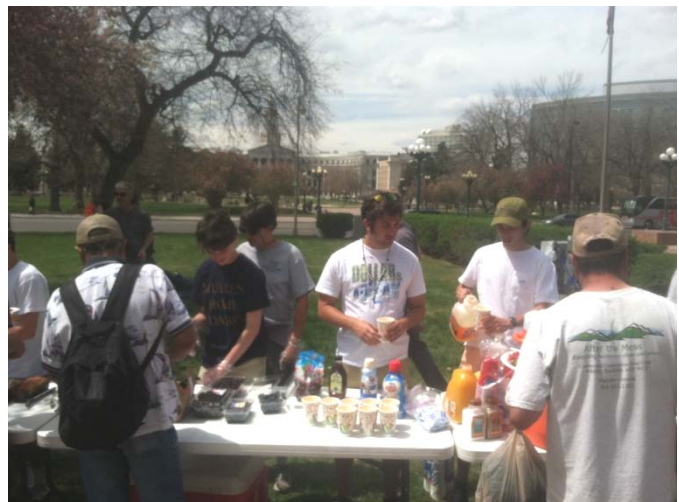
SPS Students serve lunch to Denver's homeless during Easter Holidays Mile High Mission Trip.

Apr 28 – Class resume from Easter Holidays ( NOT SPRING BREAK! ) with C D E F April 29 – President's Assembly April 30 – Student Council Level Elections May 2 – Sophomore Service Day May 3 – Junior-Senior Prom (Abita Quail Farm) May 5 – Class of '14 Alumni induction ceremony (8) May 6 – Pack Time / AP Exams begin May 7-9 – Senior Exams May 9 – Pie Bowl May 10 – Habitat for Humanity Club Work Day May 10 – Band Concert May 13 – President's Assembly – Band Awards in PM May 14 – Athletic Awards in AM May 14-16 – Pre Freshmen Exams begin May 14 – Senior Grad Night May 15 – Level Awards Assembly in AM assembly May 15 – Original One Act Plays by Theater Classes (always an experience) May 16 – Major Awards Assembly in AM assembly ( dress uniform day ) May 18 – Senior Graduation (10 am in the BAC) May 19 – Exam Schedules Begin for grades 9-11