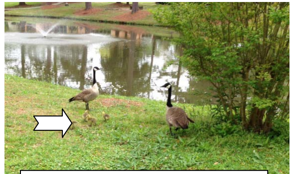
Proud goose parents with four goslings!