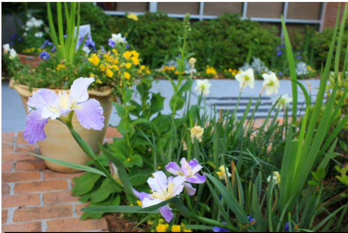
More spring flowers thanks to Botanical Wolves!

Spring Stomp 5K Run: The Junior League of Greater Covington is hosting its 7th Annual SPRING STOMP 5K Run and 1 mile Fun Run for families on Sat, May 17. The race begins at 8:00 at Hubie Gallagher Park (1000 West 15 th Avenue in Covington.) The Spring Stomp helps raise awareness of childhood obesity in our community and funds for local projects supported by the JLGC. A spirit award is given for the school with most participation and a bike giveaway for participants under 16 years of age. Registration is $8/person (16 and under) and includes a t-shirt and refreshments from our community sponsors. The JLGC is a non-profit organization of over 300 women who are dedicated to making a difference in the lives of people in our community