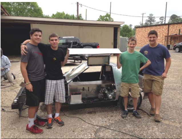
Wolves on Wheels work hard last week to prepare for competition in Houston! Geaux W on W!