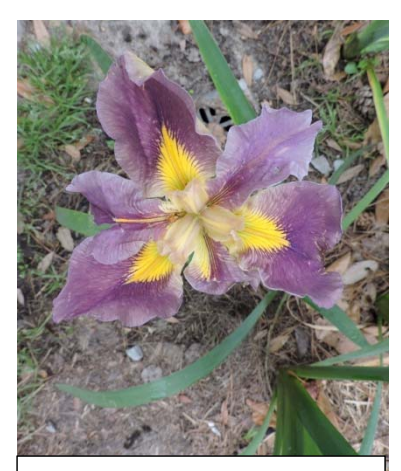
Easter beauty fills the campus. Thanks, Botanical Wolves!

How have we done with Brother Superior's challenge in the past year? Let us commit ourselves to doing even more this year, accepting the grace of Easter to help accomplish the goal of being