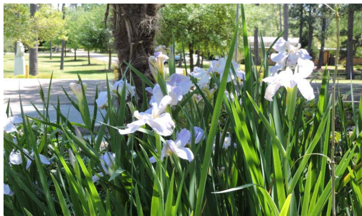
Iris decorate our Garden of the Month campus

Father-Son Dinner: The deadline for making reservations is Wednesday, April 20 as we need to give the caterer (Sweet Daddy’s) an accurate number. Hope you can make this great event!