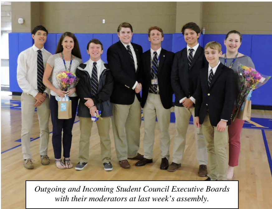
Outgoing and Incoming Student Council Executive Boards with their moderators at last week’s assembly.