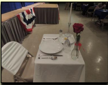
POW table with the red rose, red ribbon, lemon, candle, salt and overturned glass.

A delicious meal of grilled chicken and pasta was prepared by alumnus Mark Dixon '81 of The Broken Egg Café and was served by the Saint Paul's Students Hosts.