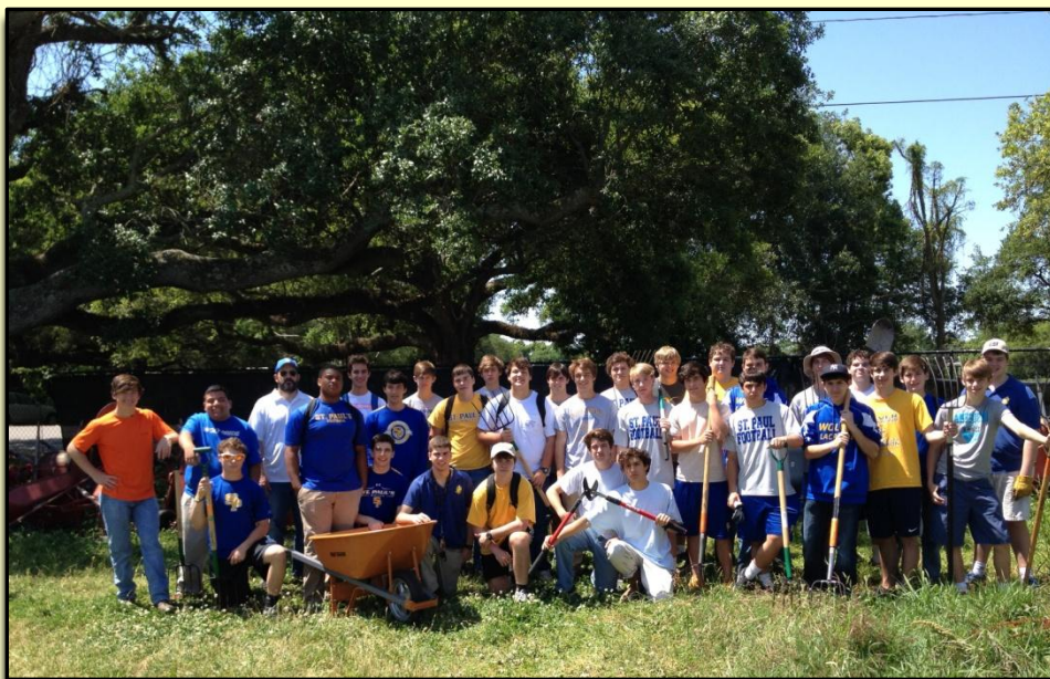
Sophomores assist in cleaning City Park in New Orleans.