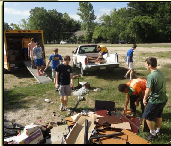
Sophomores sorting items at the Covington Food Bank and Thrift Store.