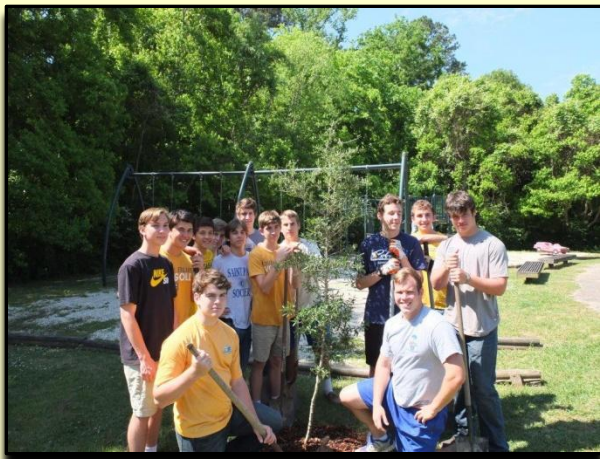
Sophomores plant eight live oak trees along 1 st Avenue.