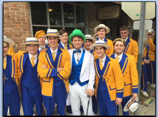
The Marching Wolves participate in the inaugural St. Patrick's Day Parade in Covington.