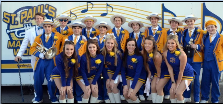
Saint Paul's Senior Marching Wolves and Golden Blues during parade season.

Click HERE to view one of the Battle of the Bands songs.