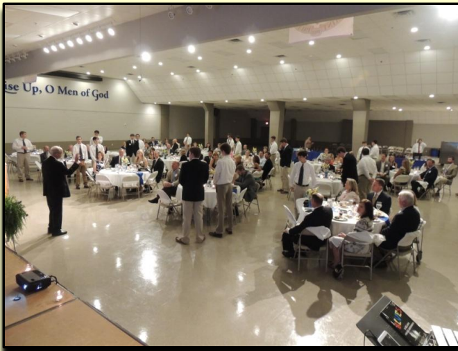
Annual Fund Dinner