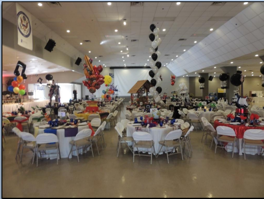
The decorations in the Briggs Center are festive and waiting for our guests to have a BAND-tastic Evening.