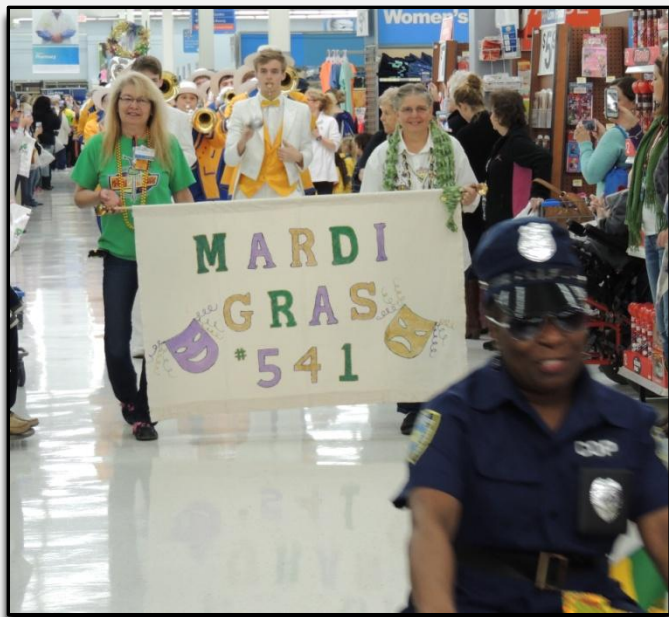
On Thursday, February 4 th the Marching Wolves performed at the Special Needs parade at WalMart.