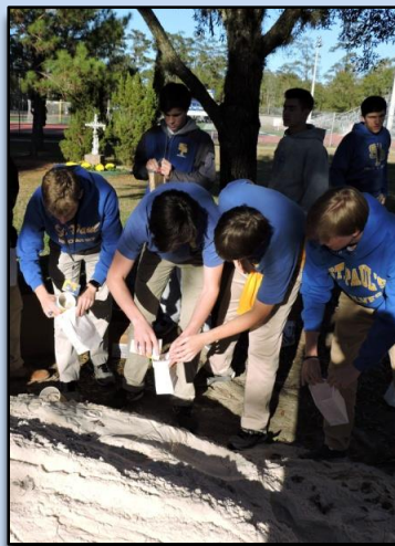
Students fill bags with sand in preparation for the luminaries event.