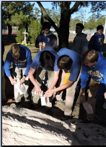
Students fill bags with sand in preparation for the luminaries event.