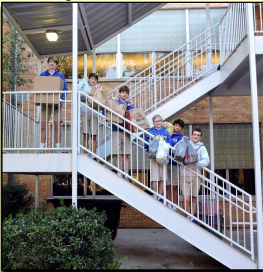
Pre-freshmen Wolves do their part for the annual food drive.