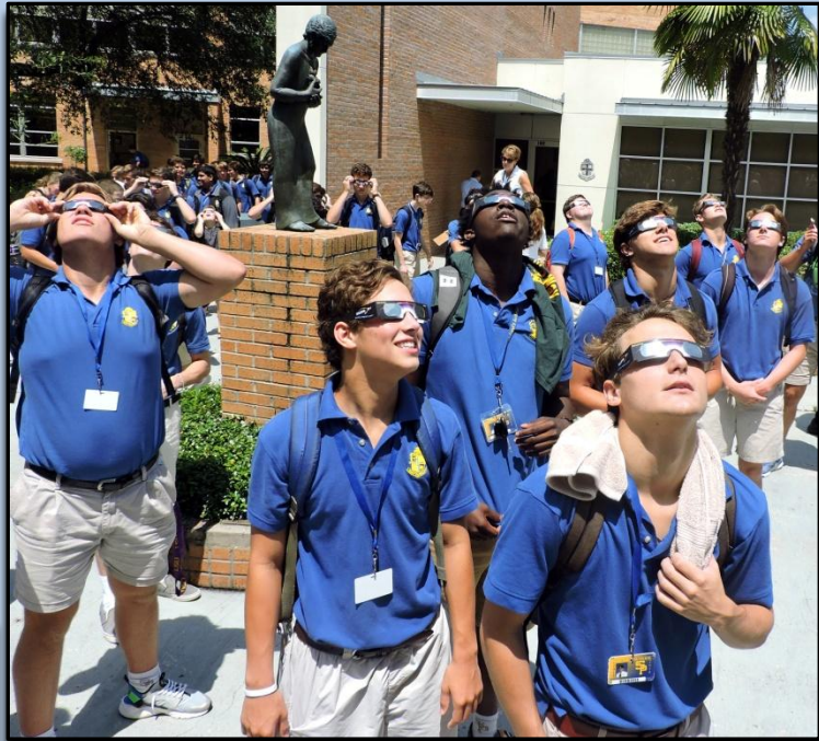
Students enjoy the solar eclipse.