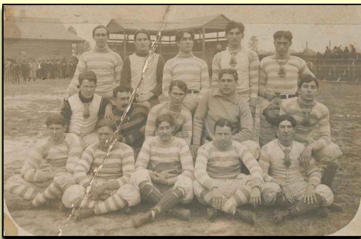
First Saint Paul's football team circa 1912.