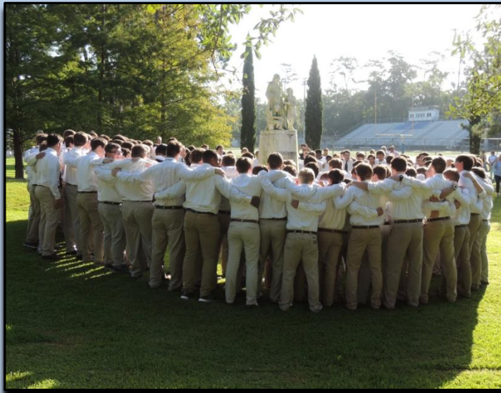
Below, seniors surround Saint La Salle singing "Rise Up O Men of God" and the fight song.