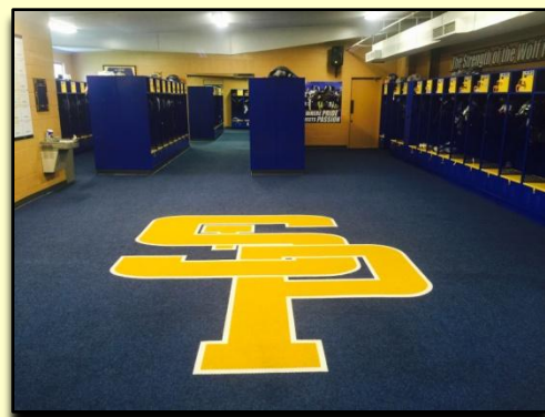
Newly renovated locker room.