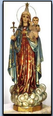
Our Lady of the Star