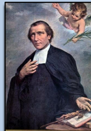
Saint Brother Solomon