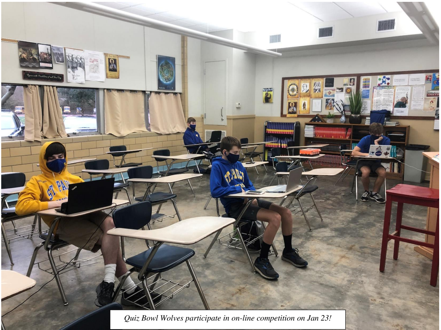
Quiz Bowl Wolves participate in on-line competition on Jan 23!

HONOR ROLL BREAKFASTS begin on Wednesday. Here is the schedule: