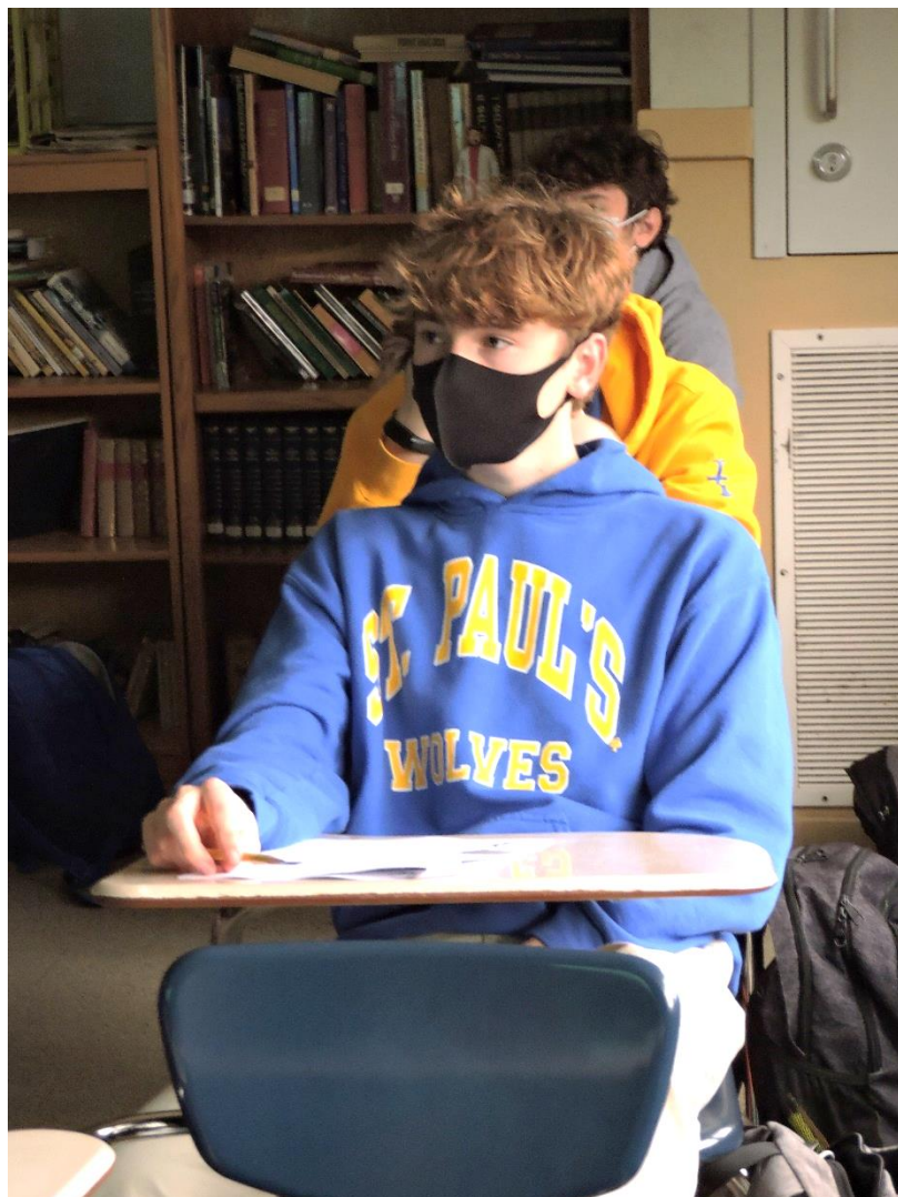
Sophs pay attention during TLC!

ANNUAL APPEAL AND GRANDPARENTS: We are blessed with many supportive grandparents. Many schools solicit donations from grandparents directly. Again, I do it differently than other schools that directly solicit grandparents. I ask that you inform your son's grandparents or, if you want, I'll be happy to send them the information directly if you wish. Just provide me with the information. I do not want to ask grandparents without your consent but we need their support. I have already received a number of grandparent gifts. Again, no gift is too small – and, of course, no gift is too large.