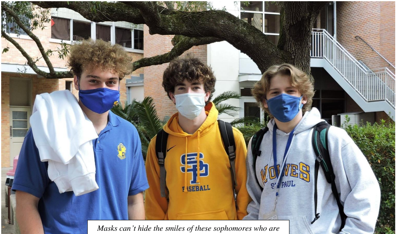
Masks can't hide the smiles of these sophomores who are happy to be at SPS!

Now let's go out there to be light, HOPE, and love to the students entrusted to our care by doing the ordinary things extraordinarily well, doing God's will, remaining faithful, letting Our Lady of the Star guide us to God, beseeching our Holy Founding Brothers to help us continue the Lasallian Mission, living courageously and respecting all people!