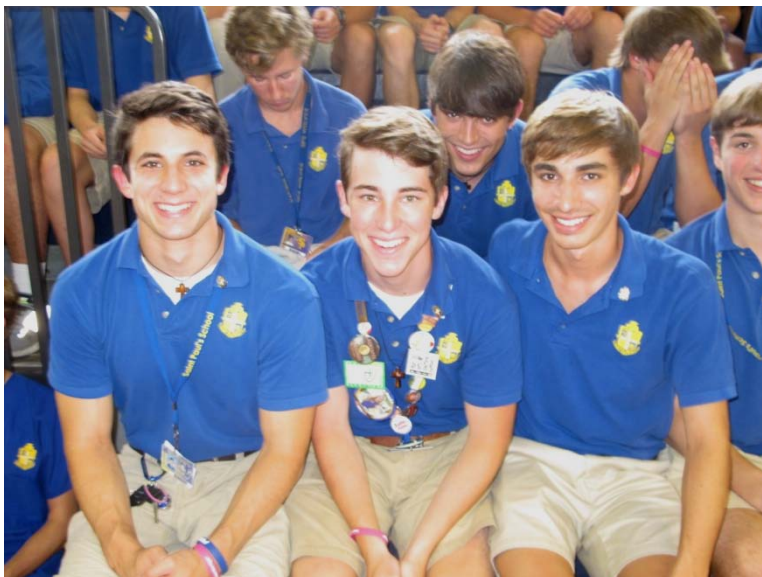
Seniors of the Class of 2015 smile after receiving their alumni pins from members of the Class of 1965!