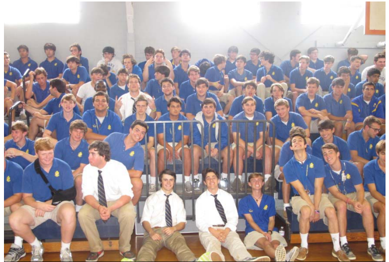
Seniors anxiously await being inducted into the SPS Alumni Association last week.

Stuff the Bus: Again this year, the six Catholic schools in Western St. Tammany (Saint Paul's, Saint Scholastica, Archbishop Hannan, Saint Peter, Our Lady of the Lake and Mary Queen of Peace) will have a Stuff the Bus food drive on Wednesday, April 29, for the Covington Food Bank. Saint Paul's will supply the bus and driver, which will visit each of the schools and load whatever canned food donations that have been collected. Last year, we literally (OK, I hate the word "literally" but it makes a point here!) "stuffed the bus" and hope to do so again this year. Thanks!