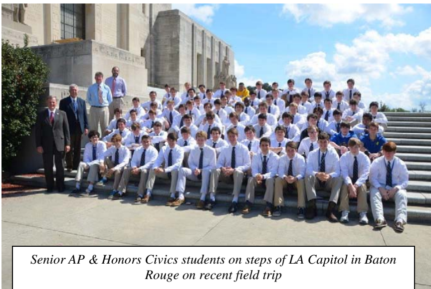
Senior AP & Honors Civics students on steps of LA Capitol in Baton Rouge on recent field trip

WHY DO I CONTINUE TO INCLUDE ANNUAL FUND REMINDERS? Because every time I do, I get responses. So, please – if you have not supported SPS this year and are in a position to do so, please contribute to the Annual Fund. ANY amount is needed as the new gym bills are coming in.