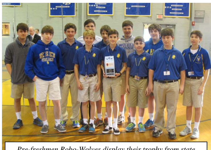
Pre-freshmen Robo-Wolves display their trophy from state competition!