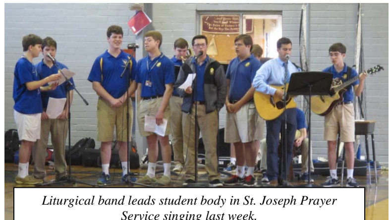
Liturgical band leads student body in St. Joseph Prayer Service singing last week.