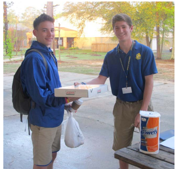
LYLs sell doughnuts on campus last week.