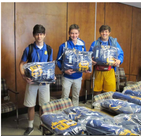
Wolves receive their well-earned letter jackets last week.