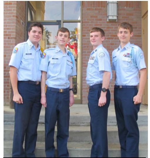
Our ROTC Quiz Bowl Team advanced to third round of ROTC Quiz Bowl. They will travel to DC this summer at government expense for final round of competition!