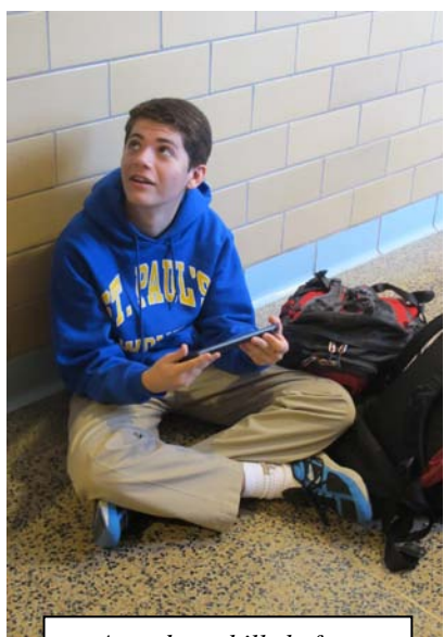
A student chills before school.

January 19 - MLK Holiday - no classes meet January 20 – President's Assembly January 22 – Guest Speaker – details to follow January 26 – Senior H. Roll breakfast January 27 – Pack Time – 10<sup>th</sup> Grade H. Roll Breakfast January 28 – 11<sup>th</sup> Grade HR Breakfast January 29 – Career Day – 9<sup>th</sup> Grade HR Breakfast January 30 – 8<sup>th</sup> Grade HR Breakfast February 2 - 9:00 AM late start for Faculty In-Service/ Parent-Teacher meetings 5-7 PM February 3 – President's Assembly February 10 - Mass Schedule - Feast of St. Scholastica February 13 – Faculty Retreat Day February 26-27 Junior Retreat/Angola Trip March 3 – Teacher Appreciation Day/Snack Day March 5 - Celebrity Waiter Dinner