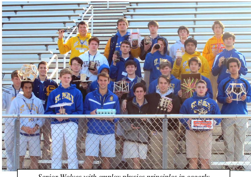
Senior Wolves with employ physics principles in eagerly anticipated "egg drop" experiment.

link: http://www.youtube.com/watch?v=2zfqw8nhUwA.