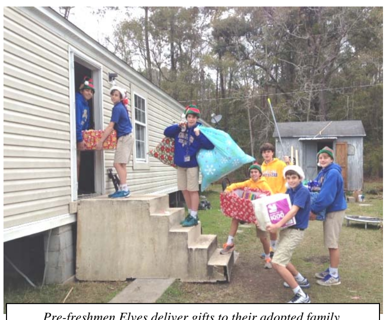
Pre-freshmen Elves deliver gifts to their adopted family.

Annual Fund: Many thanks to those who have responded to my request. For clarity, I offer the following: