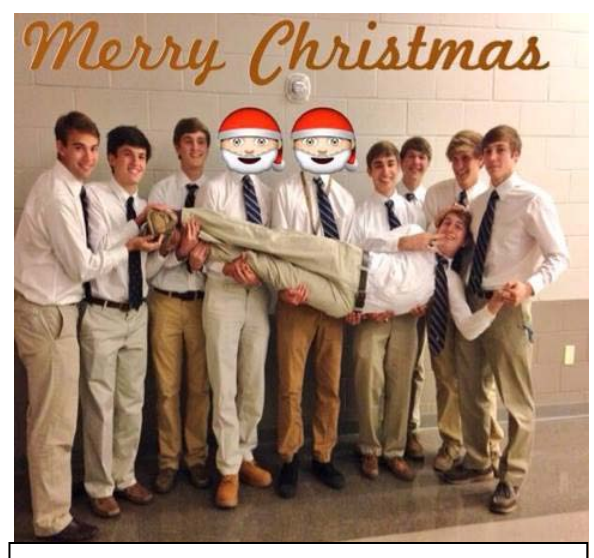
Soccer Wolves get creative with Christmas card.

Welcome to January: Here are some of the causes celebrated in January: Apple and Apricots Month, Artichoke and Asparagus Month, Bath Safety Month, Be Kind to Food Servers Month, Birth Defects Month, California Dried Plum Digestive Month, Celebration of Life Month, Financial Wellness Month, Get A Balanced Life Month, Get Organized Month, International Creativity Month, National Clean Up Your Computer Month, National Glaucoma Awareness Month, National Hot Tea Month, National Mentoring Month, National Polka Music Month, National Poverty in America