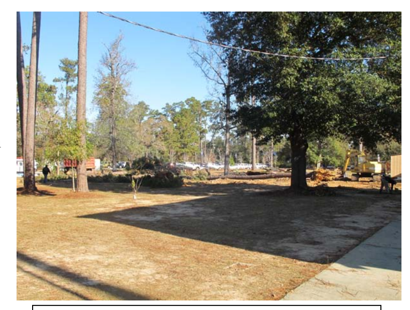
Work continues on the new gym with the site now ready.

Whew! I've worn you out in this first week of 2015, but you had the last two weeks off!