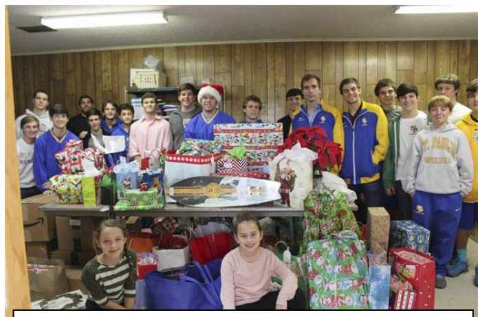
Wrestlers have a party for Fairhaven Children's Home