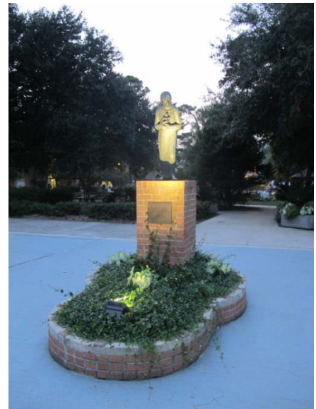
Founders' Circle at dusk

October 27 – Assembly for Guest Speaker, Bro. Ghebreyesus October 28 – President's Assembly October 29 – 8 th Grade HR Breakfast – Snack Day October 30 – 9 th Grade HR Breakfast October 31 – Day of the Dead ceremony – Assembly Schedule November 3-18 – Food Drive begins November 3 – Late start of teacher In-service November 4 – Teacher appreciation day-Assembly Schedule – Shadow Day November 5 – Sophomore HR Breakfast – ACT Aspire for 9 th Graders November 6 – Junior HR Breakfast /ACT Aspire for Sophomores Periods CDE November 7 – Senior HR Breakfast November 13-14 – Pre freshmen retreat/service days (on campus) November 18 – Food Drive ends November 21 – Thanksgiving Holidays begin at 3:00PM December 1 – Parent/Teacher meetings in BAC 5-7 PM December 11 – Luminarios – Snack Day December 16-19 – Semester Exams December 19 – 11:00 AM dismissal for Christmas Holidays January 5 – Classes resume January 6 – President's Assembly – Snack Day January 7-9 Seniors on Retreat January 29 – Career Day