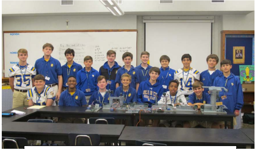
Pre-freshmen build assembly line in Hornbeck Offshore Gateway to Engineering class.