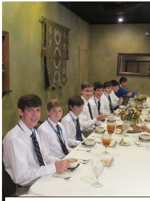
Pre-Freshmen Wolves learn etiquette while enjoying a fancy meal at N'tini's!