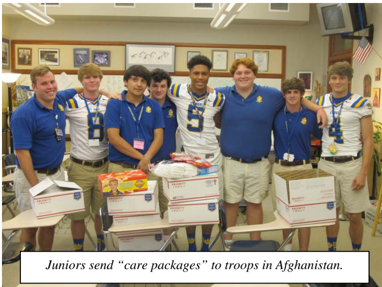
Juniors send "care packages" to troops in Afghanistan.

Parent-Teacher Conferences are Mon, Oct 20, from 5-7 in the BAC.