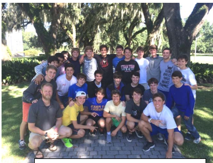
Wolves listen to God in the silence of Manresa!

Parent-Teacher Conferences are Mon, Oct 20, from 5-7 in the BAC.