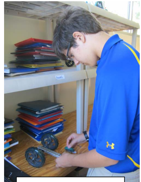
Engineering II student works on his solar car.

Suppose we replaced “teacher” with “parent”, “school” with “home” and “education” with “parenting.” Some interesting possibilities result!