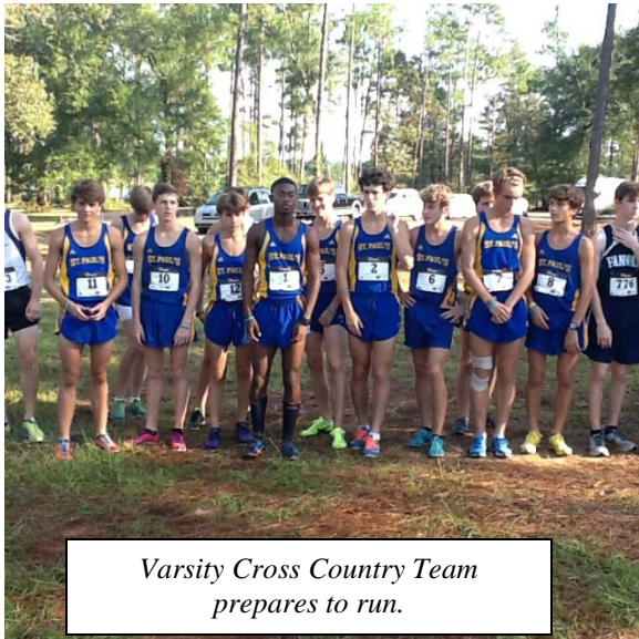
Varsity Cross Country Team prepares to run.

October 16 – Redi-Step Test for 8 th Graders (Periods FG) October 17 – Homecoming Day – Pep Rally Schedule October 20 – Parent/Teacher Conferences at 5-7 PM October 24 – Pep Rally Schedule October 27-28 – Freshmen retreat/service days (Camp Abbey) October 27 – Assembly for Guest Speaker, Bro. Ghebreyesus October 28 – President’s Assembly October 29 – 8 th Grade HR Breakfast – Snack Day October 30 – 9 th Grade HR Breakfast October 31 – Day of the Dead ceremony – Assembly Schedule November 3-18 – Food Drive begins November 3 – Late start of teacher In-service Nov 4 – Teacher appreciation -Assembly Schedule – Shadow Day November 5 – Soph HR Breakfast – ACT Aspire for 9 th Graders November 6 – Junior HR Breakfast /ACT Aspire for Sophomores