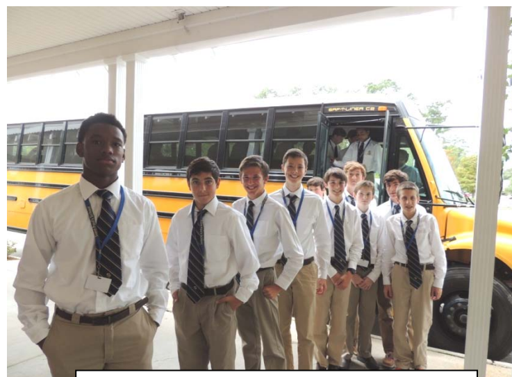
Pre-freshmen prepare to board bus to take them to etiquette training – and lunch!