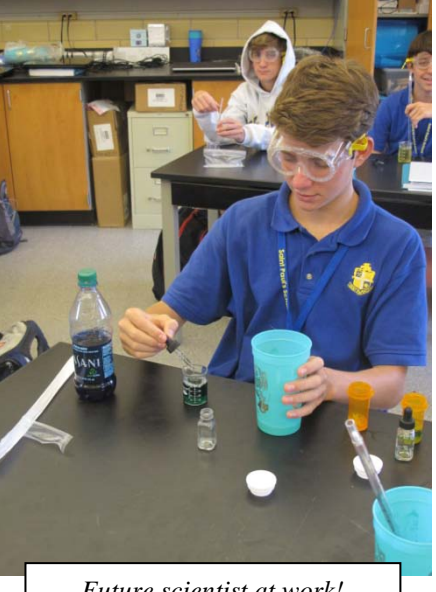
Future scientist at work!