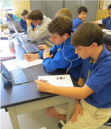
Students hard at work using technology and sharing music!

October: Welcome to the month of October – the tenth month of the year, even though “octo” means eight. I hope you know why this discrepancy exists! In any event, I draw the following to your attention as we begin October: