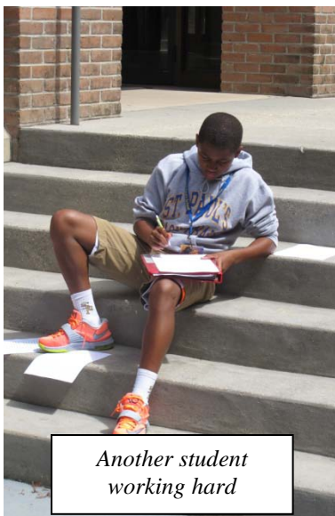
Another student working hard