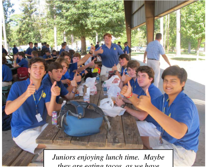
Juniors enjoying lunch time. Maybe they are eating tacos, as we have Taco Tuesday at SPS every week.