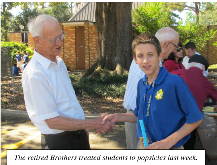
The retired Brothers treated students to popsicles last week.