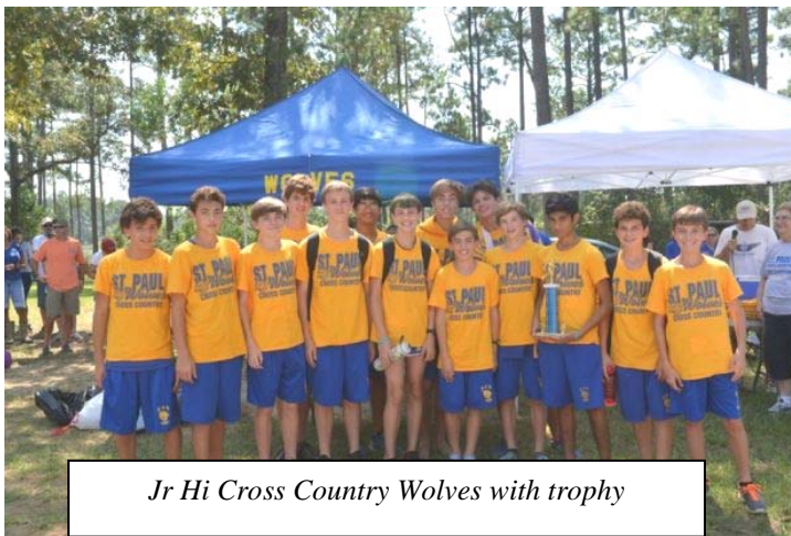
Jr Hi Cross Country Wolves with trophy