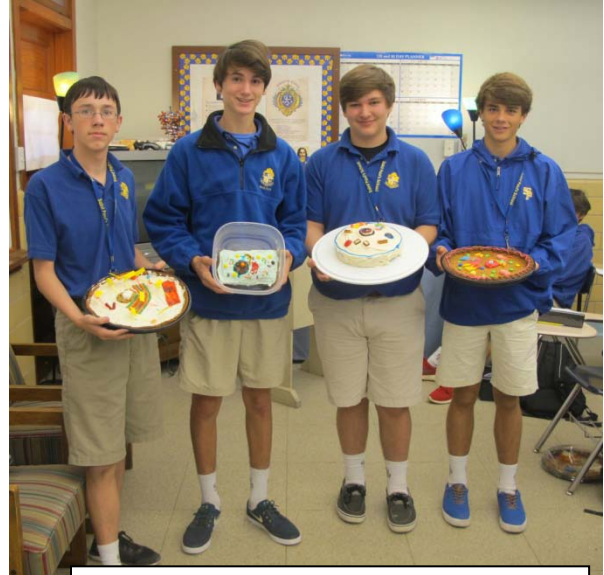
Sophomores with their always popular edible cell projects