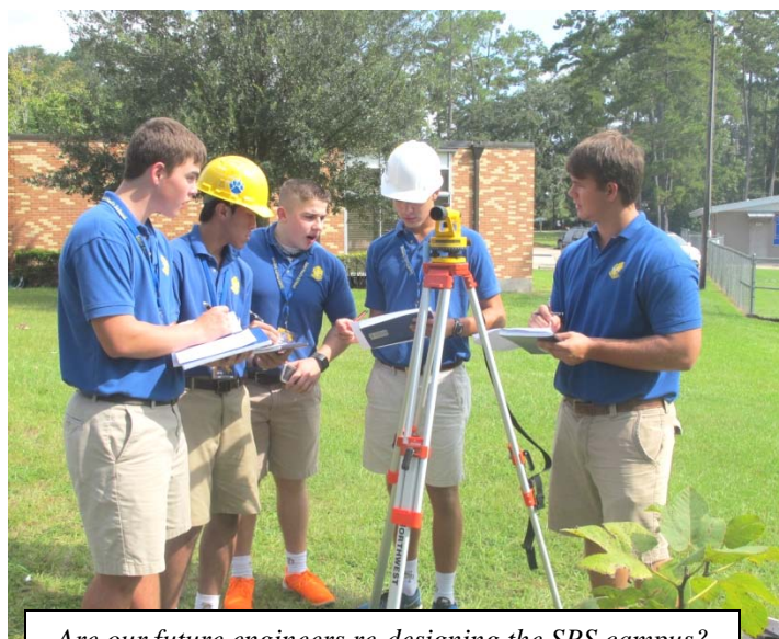
Are our future engineers re-designing the SPS campus? Thanks, Hornbeck Offshore Services for sponsoring our nationally certified Engineering Program.