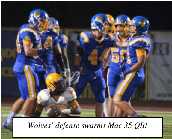
Wolves’ defense swarms Mac 35 QB!