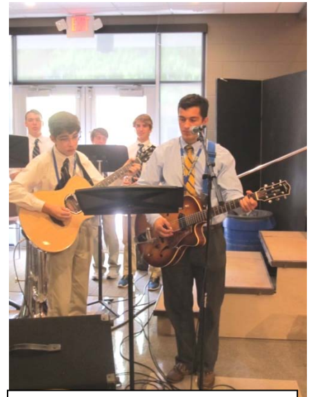
Liturgical Band "makes joyful noise to the Lord" at mass last week