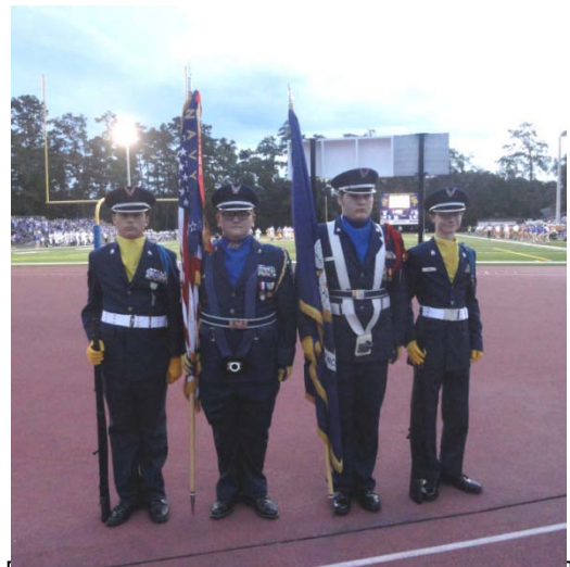
LA 41 st 's finest present colors on Fri night.