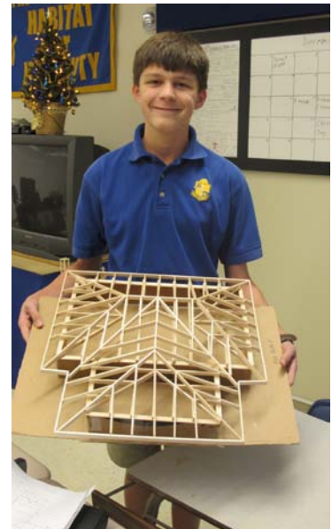
Geometry student proudly displays his geometry project.

January 27-12 th HR Breakfast January 28 – 11 th HR Breakfast – Pack Time during HR Breakfast January 29 – 10 th HR Breakfast January 30 – 9 th HR Breakfast – Career Day for Juniors February 3 – 8 th Grade Honor Roll Breakfast February 3-7 – PLAN Test for Sophomores February 3 – Parent/Teacher Meetings in Briggs Center (5-7 pm) February 4 – President/Principal's Assembly – Snack Day February 5 – Pack Time February 13-14 Juniors on Retreat/Angola Trip February 17 – ROTC Inspection February 18 – President/Principal's Assembly February 27 – End of Third Quarter; Mardi Gras/Lent Holidays begin at 3 pm February 28 – Faculty Retreat (no classes) March 10 – Classes resume; St. Joseph Altar (all periods meet) March 11 – President/Principal's Assembly March 13 – Celebrity Waiters Dinner March 14 – 9:30 Late Start (Periods DEF meet) March 17 – Pack Time March 18 – ACT testing on campus for all juniors/ Explore of all 9 th Graders March 19 – Mass – Feast of St. Joseph