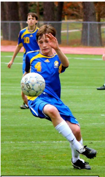
#4 prepares to contact the soccer ball in a recent 8 th grade game.

Sweatshirts & Cold Weather: With the exceptionally cold weather last week, we relaxed our rule and allowed heavy coats and other warm weather gear. Now that things are more seasonal, we return to policy: ONLY SPS cold weather wear is accepted. If this presents a problem, please contact me.