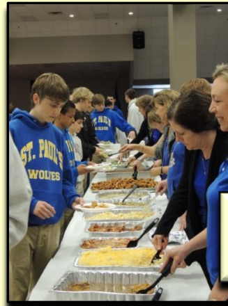
Members of the Mother's Club assist in serving the students.