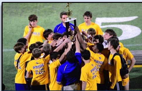
First place winners!