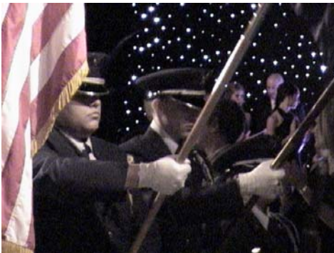
Presenting colors on the SPS field and at the Olympia Ball