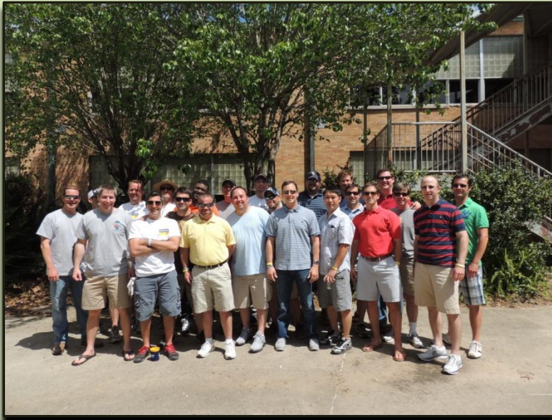
Members of the Class of 1993.