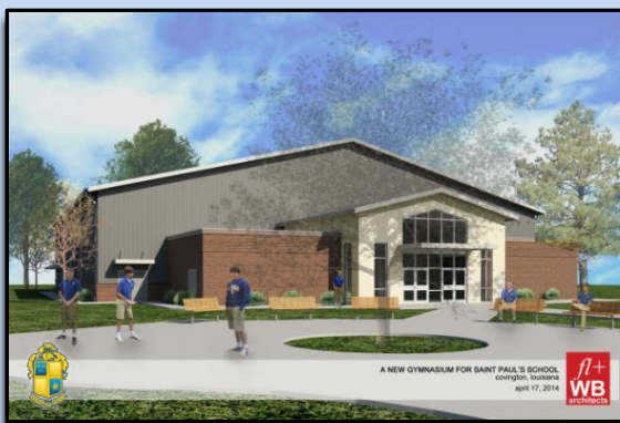
New Gymnasium Rendering

If you are interested in funding the project, or participating in any number of naming opportunities available please contact Brother Ray directly 985-892-3200 ext. 1001 , or the Development Office of Saint Paul's 985-892-3200 ext. 1270 . Click HERE to view corresponding Paper Wolf article. Bookmark our WEBPAGE to view the ongoing construction.