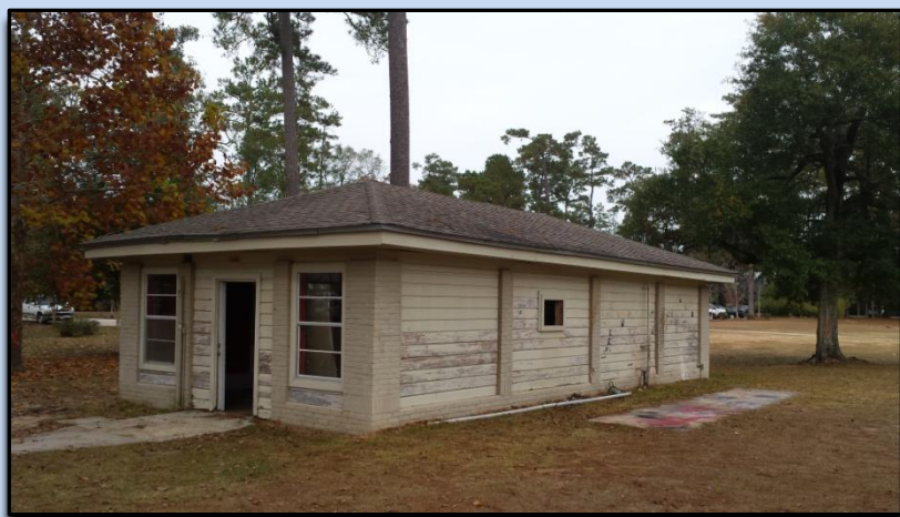
Pictured above is the old room 500 before demolition.