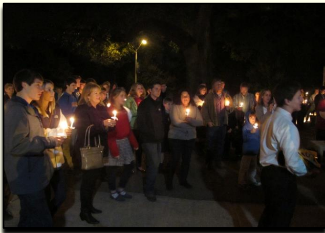
A crowd assembled to join in the caroling.