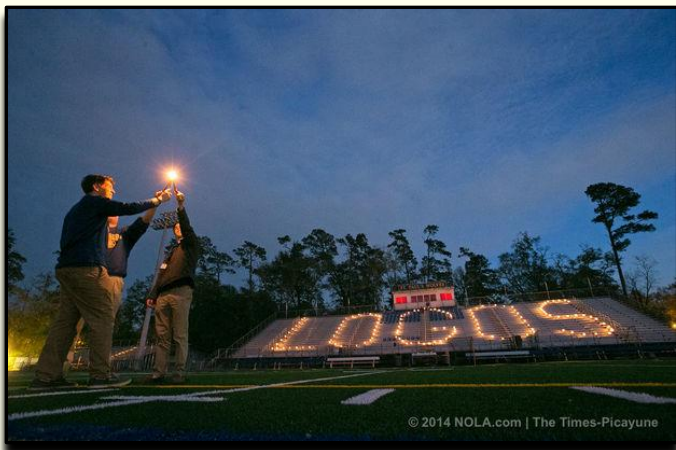
Logos – Greek for "The Word of God".